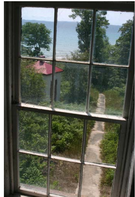
View from window of 1867 Lighthouse