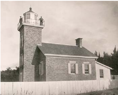
Early view of South Fox Island Lighthouse

Fox Island Light Station is certainly special. We invite everyone to be part of our effort to save this unique Maritime Heritage site. This property is state-owned so we all own it, and have responsibility for it. FILA (Fox Island Lighthouse Association) has for 10 years been working to clear, repair, clean, recover and improve accessibility to the seven buildings on the 115 acre southern tip of South Fox. If you have an interest and some time or other resources which might help please contact me or any FILA member. For a really enlightening view of what has been done and what could be done go to the FILA Website, Facebook pages or call me (231-947 1926). My email is mckinne8@msu.edu. John McKinney FILA President