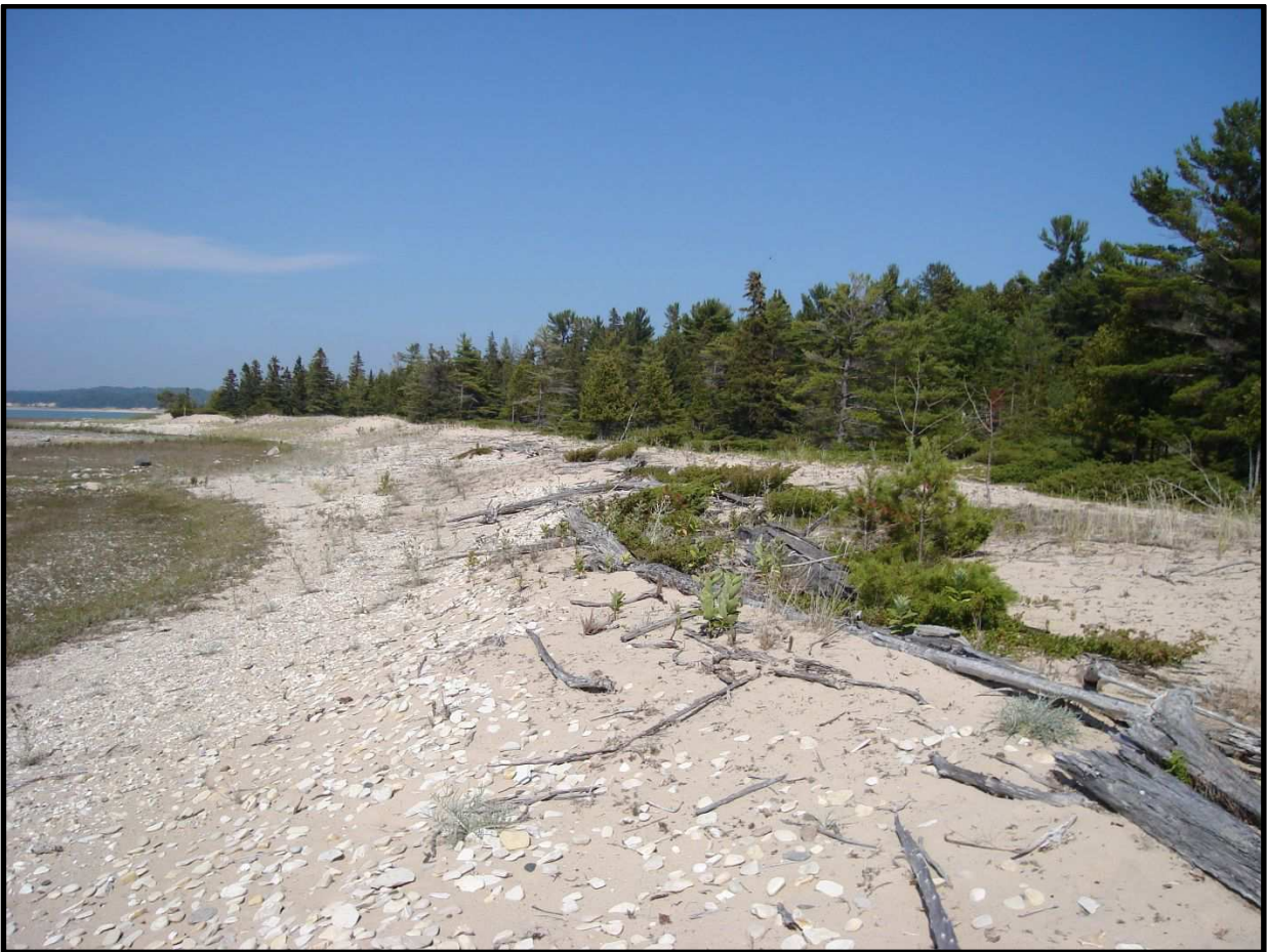
McFadden Point, Beaver Island.